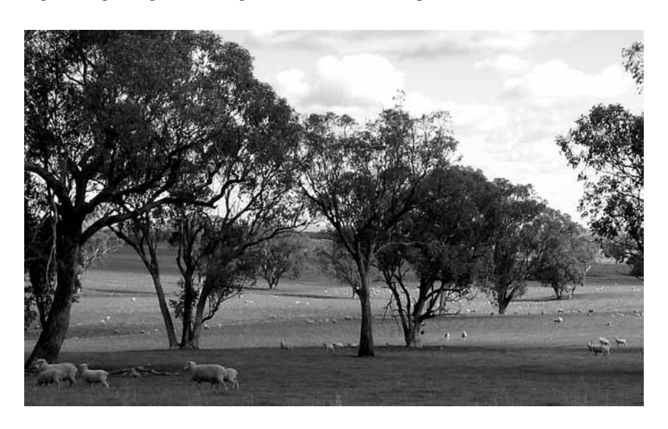
Figure 8.1 Mixed Farm in Central West NSW – A Relic of the Past?

Agriculture in many developed countries has undergone a transformation – becoming both increasingly intensified and specialised. Accompanying this trend has been a decrease in mixed farming systems and the ongoing substitution of labour for capital. This chapter explores these trends in the Australian context where many competing forces are shaping the agricultural landscape. While recognising that economic, technological and food security factors are key forces, the chapter focuses on the role of knowledge intensity as a driver of farmers' decisions to specialise in both commodity production and land use. The growing knowledge intensity of agriculture, accompanied by a concentration in human capital, is putting increased pressure on farm managers to maximise investments