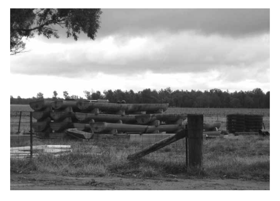
Figure 8.4 A Stockpile of Water Troughs and Fencing Materials – Removed after a Switch from Mixed Farming to Cropping

farmers who had switched to cropping had already removed fences, water troughs and even shearing sheds and sheep yards.