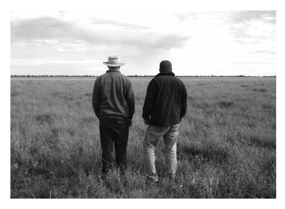
Figure 8.3 Shared Decisions are Important in Farm Management

other neighbouring farmers to jointly employ a skilled farmhand, told how his neighbour was having problems with hiring, particularly at peak times like crop planting: