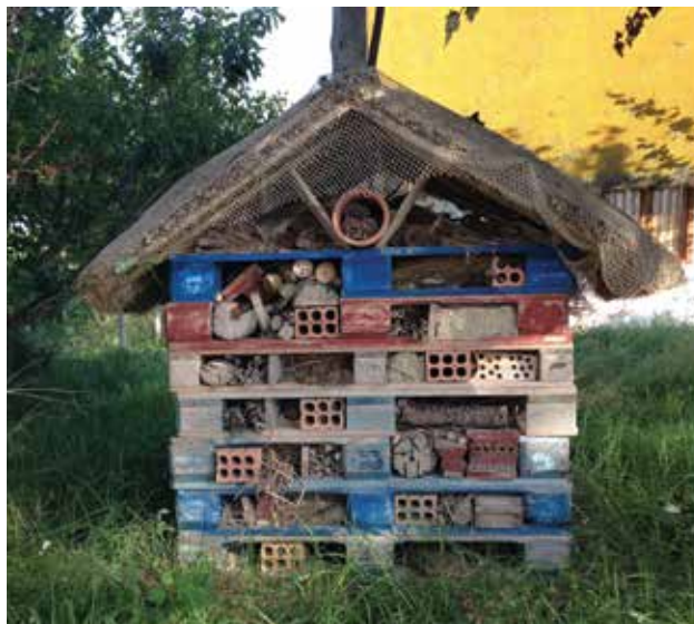
Insect hotel – example of promoting biodiversity in rice fields in Spain