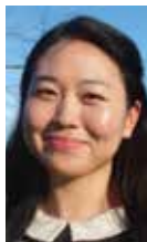
Juni Sul Oxfam