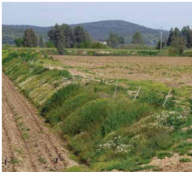
Biodiversity action plans on tomato farms - reprofiling and seeding of field margins